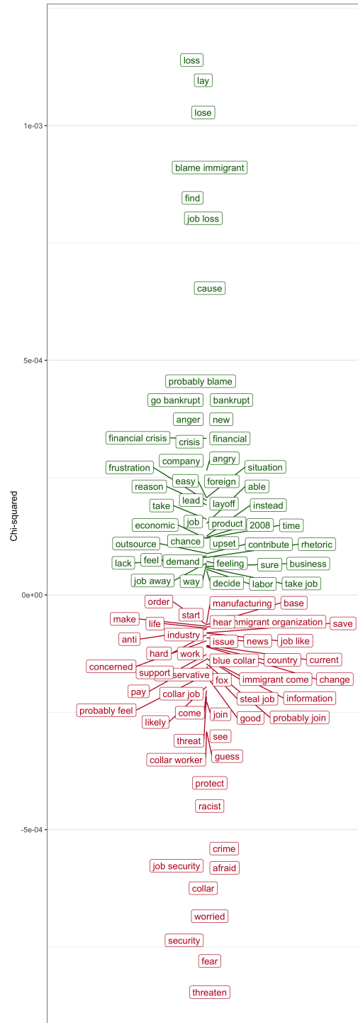
FIGURE 2. MOST CHARACTERISTIC PHRASES OF EACH CONDITION

Note: Figure displays the phrases with the hundred largest \chi^2 statistics. Figure omits the word "blame," which has a \chi^2 statistic of .00207, in order to better scale the other phrases. Phrases with a positive \chi^2 statistic are more characteristic of the After Crisis condition; phrases with a negative \chi^2 statistic are more characteristic of the Before Crisis condition.